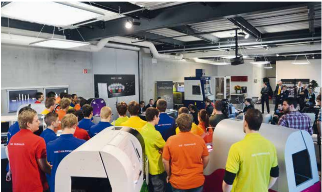
During the launch of the SwissNano machine, three classes of apprentice bar-turners and mechanics were in attendance. They all agreed that the machine was perfectly suited to their modern, colourful world.